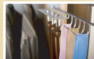
Belt & Tie Racks